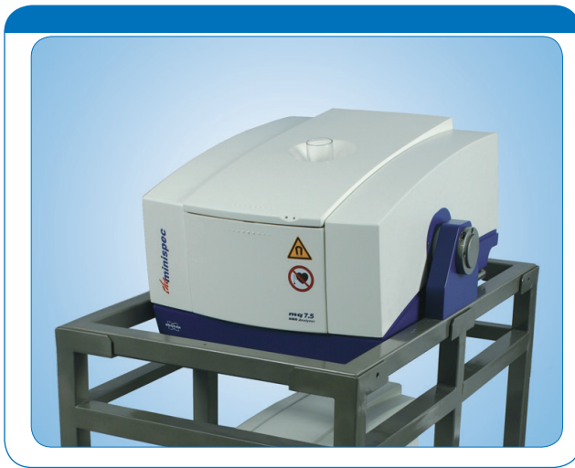
minispec Magnet on Cart for vertical and horizontal Access