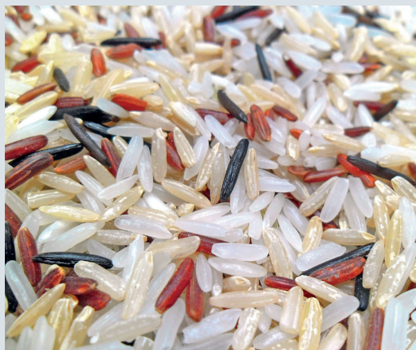
Fig. 1: A variety of wild, brown and white rice