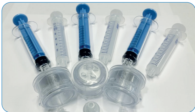
Fig. 1: OSS ClearShot™ oil and grease extractor.