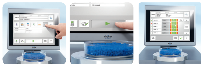
Modern software interfaces guide the user step by step to the analysis results

Since NIR methods require no sample preparation, the amount of sampling error is significantly reduced, improving the accuracy and reproducibility of the analysis.