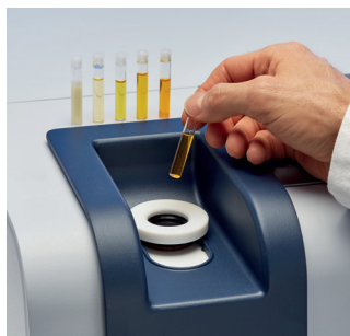
Measuring through glass avoids complicated sample preparation affected by tilt.

Moreover, FT analyzers provide (in contrast to scanning dispersive spectrometers) the possibility to rotate the sample during the analysis in order to scan a bigger sampling spot compared to a static measurement, leading to more representative result and higher accuracy.