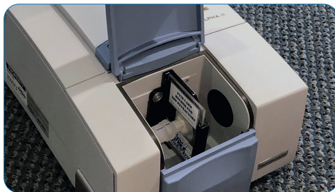
Fig. 2: Oil membrane mountend inside ALPHA II FTIR spectrometer.

The ASTM D7575 method uses solid-state calibration standards with known amounts of oil on the filter membrane. Thus, no calibration samples are needed to be prepared by the user.